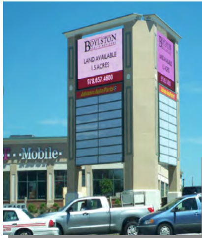
Pylon sign with electronic messaging capability measuring 14' x 9', 26' above the ground facing the bustling Bell Circle and Route 1A.

Contact Dan Rabazzi 978.284.8148 - drabazzi@boylstonrealty.com